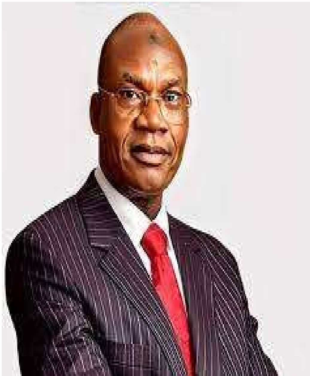
Professor Tahir Mamman Honourable Minister for Education