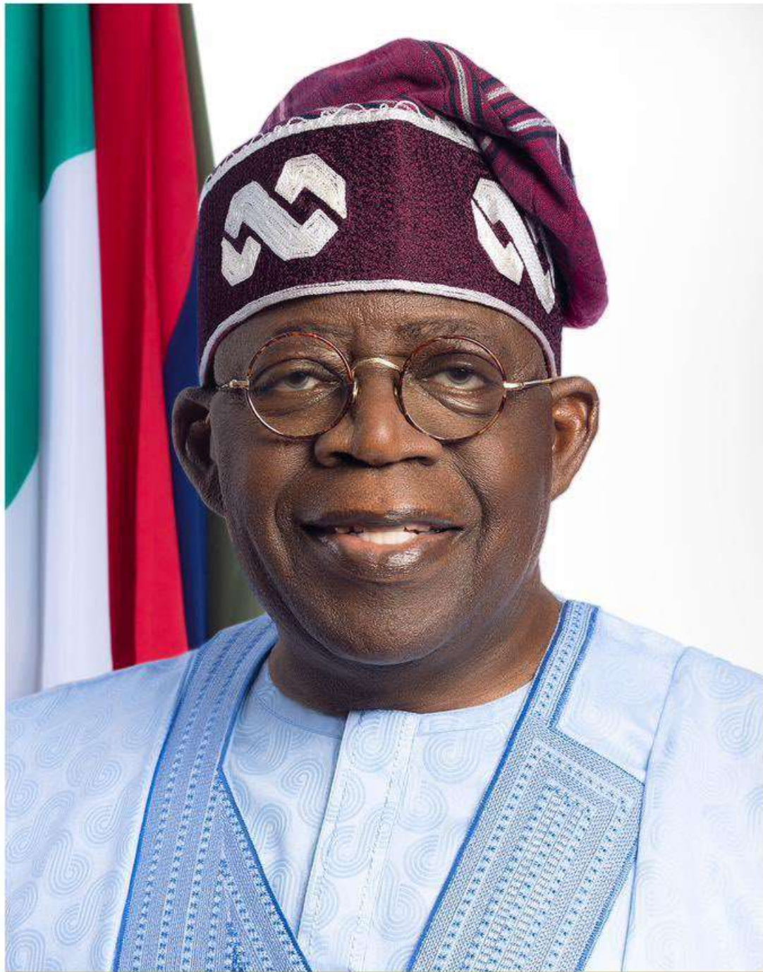
HIS EXCELLENCY BOLA AHMED TINUBU CCFR PRESIDENT, COMMANDER-IN-CHIEF OF THE ARMED FORCES FEDERAL REPUBLIC OF NIGERIA.