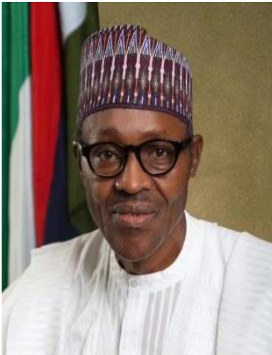
Muhammadu Buhari, GCFR President, Federal Republic of Nigeria