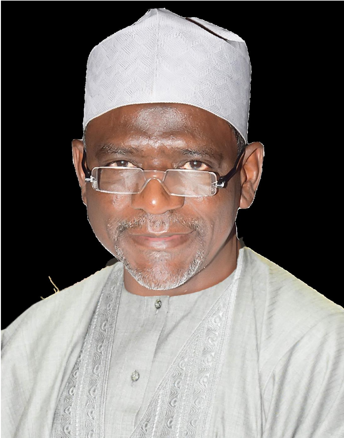
Mallam Adamu Adamu Honourable Minister for Education